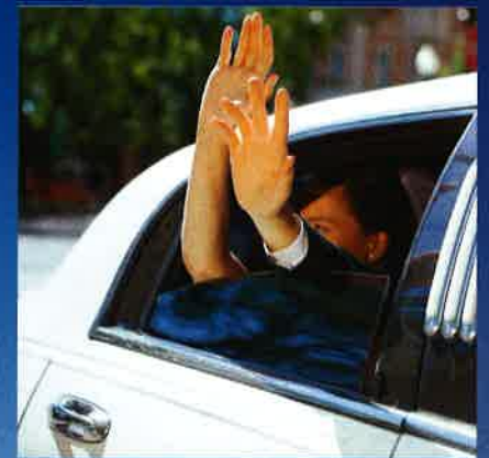
Save the date.